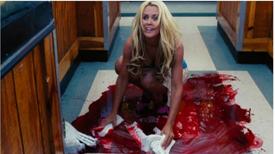
Fig. 2: The unforgettable supermarket scene in Dirty Love

make a trip to the supermarket. As she hovers in the personal hygiene aisle, frantically scanning the shelves for a box of affordable tampons, she realizes she is unable to buy any of them. Much to her dismay the only kind in her price range are elephantine maximum absorbency pads. Just as she sighs in frustration, she begins to leak blood all over the floor. Panicked, she grabs the pads and races to the washroom. Finding it occupied, she runs towards the checkout only to spot her ex, Richard, nearby. To avoid him, she sprints across the supermarket all the while gasping and making a myriad of comical grimaces. In a perversion of the proverbial banana peel gag, an elderly woman creeping along the meat aisle accidentally slips on Rebecca’s bloody trail. She drops her grocery basket and falls on her back, crying “Help! I’ve fallen...” She tries to sit up, only to notice the blood on the arm of her blue cardigan, “...and I’m bleeding. Oh no!” While this moment is played up for ultimate slapstick effect, Rebecca’s menstrual mire is quickly turned into dangerous territory in more ways than one.